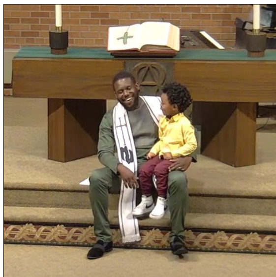
Children's Sermon June 25