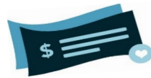
Bring to church