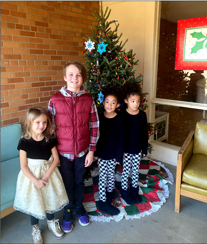
Thank you to our children and youth for your service to others and to the church!