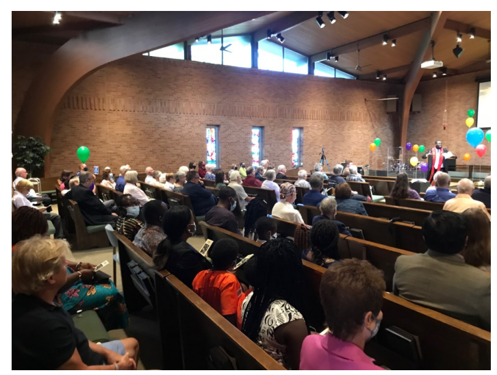
Thank you for the generous and warm welcome for me and my family Sunday, October 3.